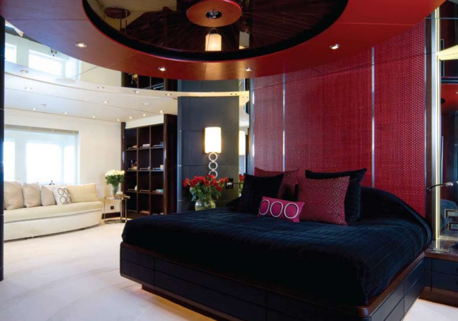
More like a stunning apartment, the owner's suite is forward on the main deck.