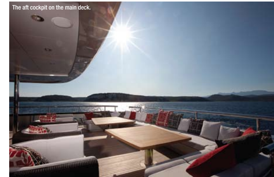
The aft cockpit on the main deck.

Yachts that seek to charter need plenty of deck space and chunks of informal leisure space and it is clear that with an ample amount of both Slipstream will charter exceedingly well (she will be available through the Burgess charter agency). Since many guests are now seeking yachts whose motion at anchor is minimised, Slipstream has been fitted with Quantum Zero Speed stabilisers. Other attributes that make the yacht highly desirable from a charter point of view include her double helping of seven-metre Nautica RIBs, a duo of Seadoo RXT 215 horsepower jetskis