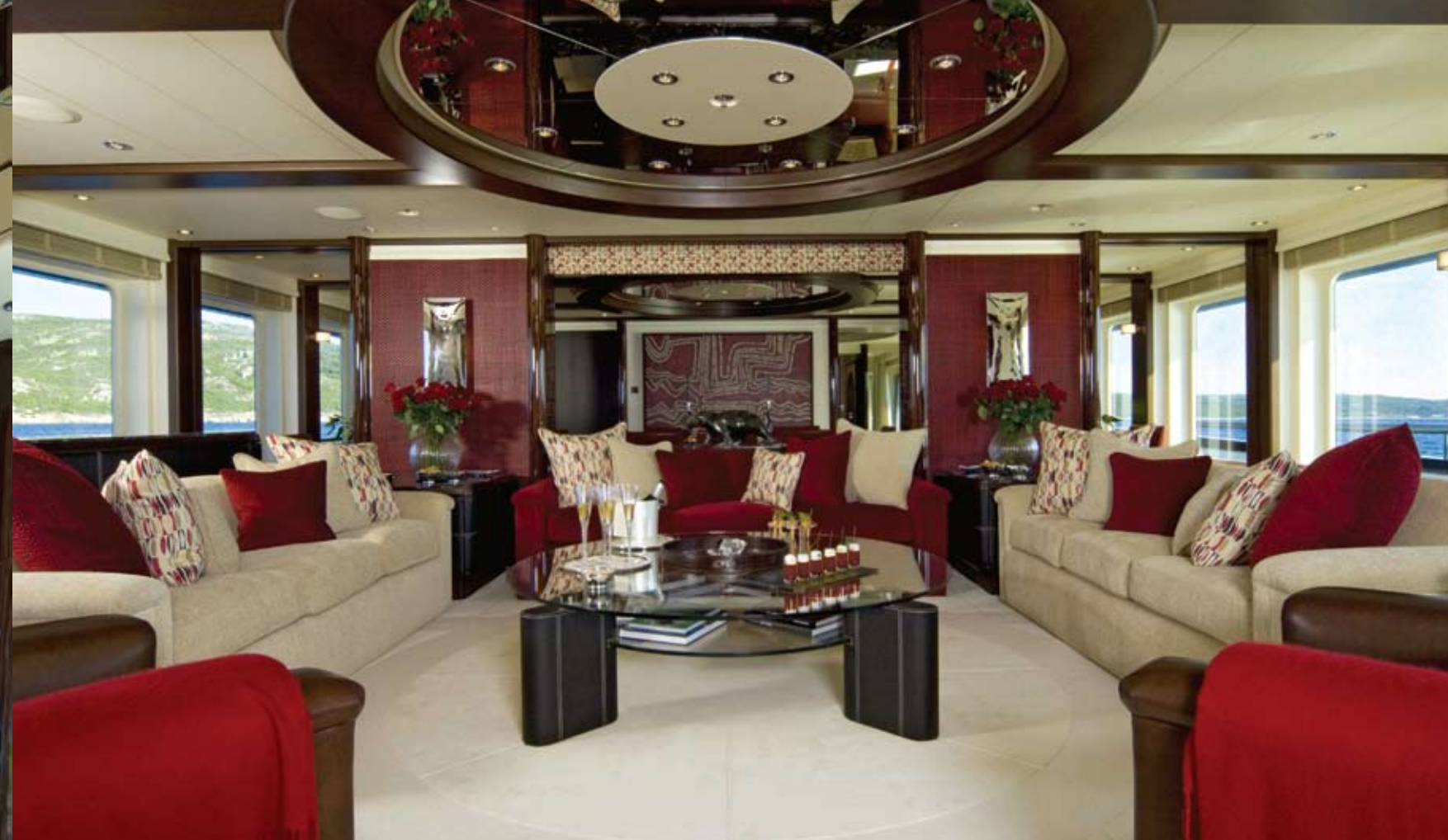
The convivial main saloon looking forward to the dining room (below right).

Each year, one single yacht from the 100 or so exhibited at the Monaco Yacht Show wins the Prix du Design, an award reserved for the most innovative and distinguished design, capable of rising above a field of truly world-class contenders. This year the award went to the proud Australian owner of the brand new 60-metre Slipstream , presented by Prince Albert at a ceremony onboard the yacht in Monaco Harbour.