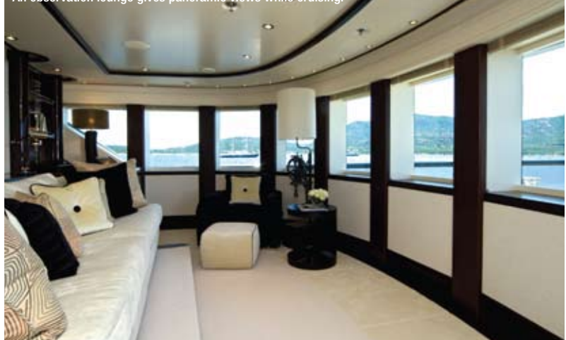
An observation lounge gives panoramic views while cruising.

"The high interior volume allows for a spacious club-like owner's suite forward, which stretches the full breadth of the main deck. It features an office, a sleeping cabin, two bathrooms, a walk-in closet and a private observation lounge with stunning panoramic views over the bow."